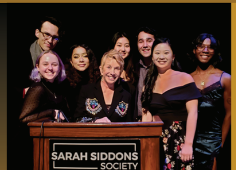
2022 Sarah Siddons Award winner, Sandy Duncan with the 2022 scholarship recipients.